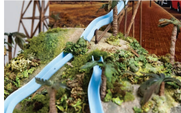
5. BETWEEN THE RESORTS