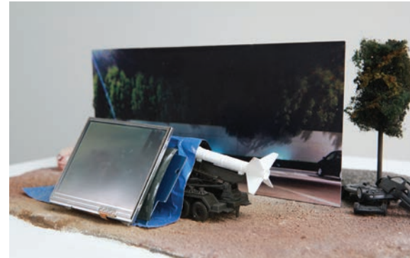
7. NEXT TO THE PARKING LOT