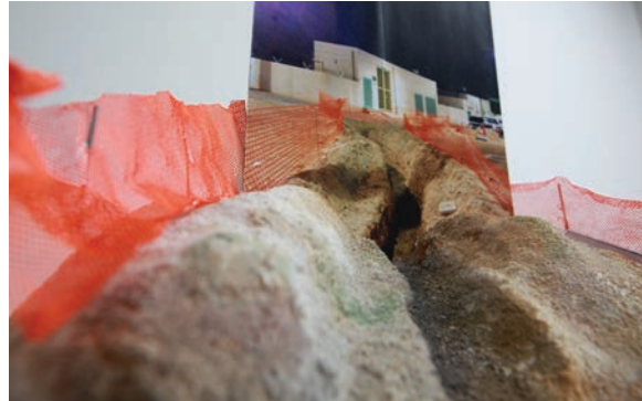
2. IN FRONT OF THE SUBSTATION