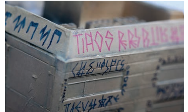
8. AT THE OLD HEADQUARTERS