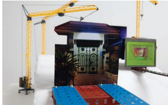
4. NEAR THE NEW VILLAS