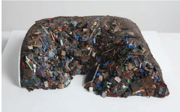
1. BEHIND THE HILLSIDE