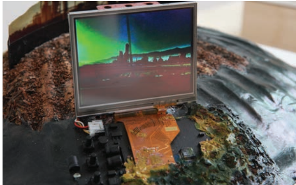
3. ALONG THE ROADSIDE